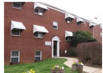
123 South Courthouse Road

RPJ Housing's main office is in Arlington, and we offered volunteer home repairs here since 1989. We look forward to becoming a neighbor in the Penrose community, and to expanding affordable rental opportunities in the county.